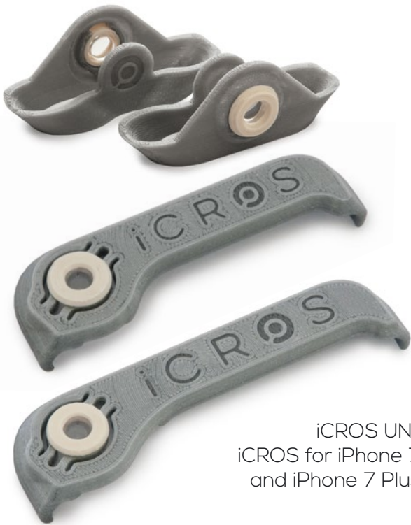
iCROS UNI, iCROS for iPhone 7 and iPhone 7 Plus

However, it is not just a name and logo change. The rebranding of iCROS also marks the release of three new iCROS products over the popular online crowdfunding platform Kickstarter. The most interesting new release by the iCROS team (led by Sebastian Pfirter from Swiss company Designerei Ltd.) is iCROS UNI, a universal model that thanks to its corner mounted orientation fits virtually any device with a corner camera – including the iPad, iPod touch, and many different smartphones.