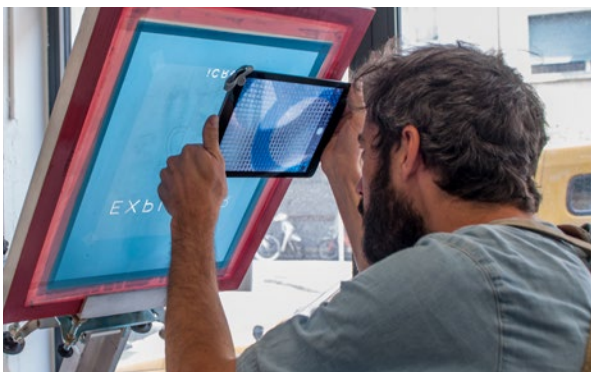
Silk-printer with iCROS UNI